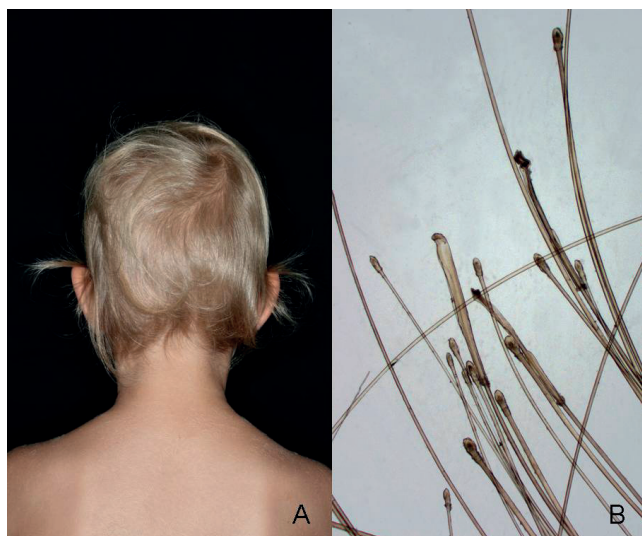
Fig. 1. The girl at the age of 5 years with sparse, fine blond hair (a) with a characteristic telogen hair root pattern in the trichogram (b) with up to 70% telogen hairs (normal rate < 20%).

What is your diagnosis? See next page for answer!